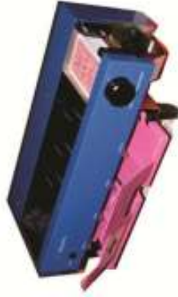
Dealer 4 dealing machine