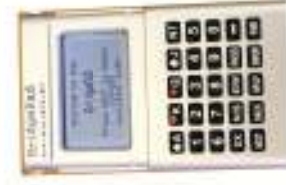
BridgePads and Scorer 11 for scoring